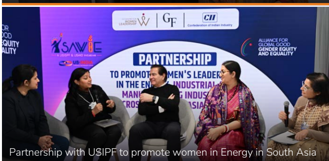
Partnership with USIPF to promote women in Energy in South Asia