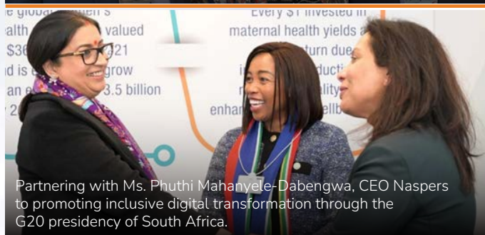
Partnering with Ms. Phuthi Mahanyele-Dabengwa, CEO Naspers to promoting inclusive digital transformation through the G20 presidency of South Africa.