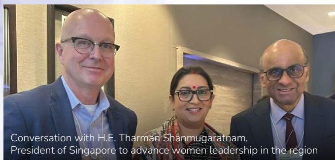
Conversation with H.E. Tharman Shanmugaratnam, President of Singapore to advance women leadership in the region

Digital inclusion & workforce access (through leadership in the B20 Task Force on Digital Transformation)