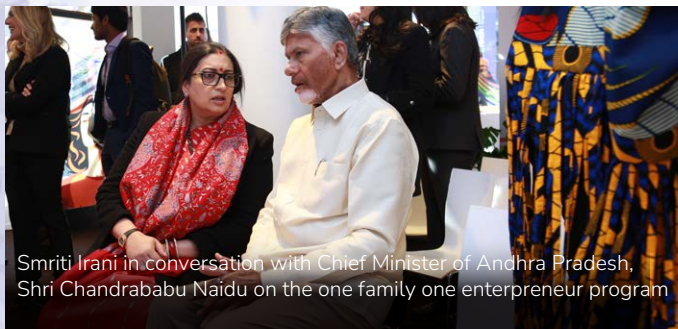
Smriti Irani in conversation with Chief Minister of Andhra Pradesh, Shri Chandrababu Naidu on the one family one entrepreneur program

The announcement also saw the promise of a partnership between the Alliance and Andhra Pradesh to develop and take global, a model of women entrepreneurship.